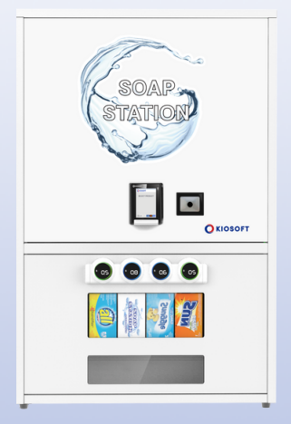
Quad – 4 Column

Model: VLA-DULT-02 26.8" W x 10.2" D x 40.9" H Capacity : 92 Weight: 105.8 lbs