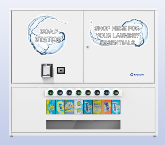
Octo - 8 Column

Model: VLA-DULT-03 Dimensions: 47.2" W x 10.2" D x 40.9" H Capacity : 184 Weight: 171.9 lbs