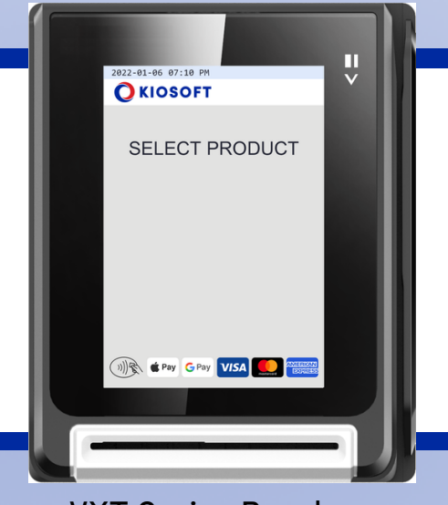
VXT Series Reader